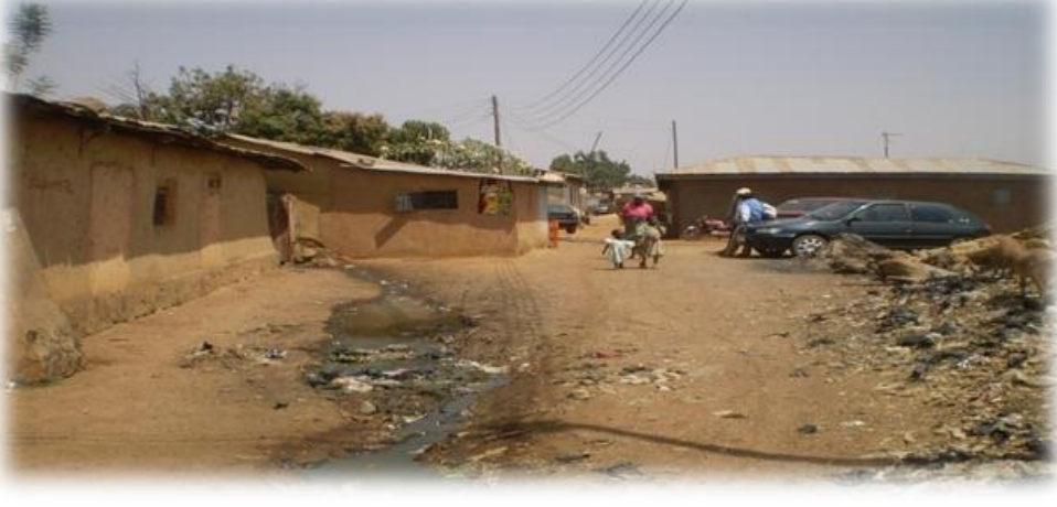
Fig. 1: Sewage disposal from houses into the streets

Due to the methods of refuse and sewage disposal in the area, air, water and soil pollutions are common. It is as a result of both the pollution from the disposal of these substances in the area and the previous tin-mining activities resulting in many forms of diseases making it very difficult an accepted environmental quality that is habitable.