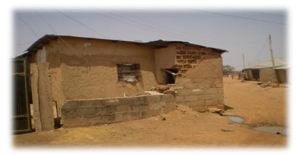
Fig. 2: Sewage disposal from houses into the streets