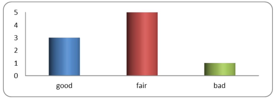
Fig 6: Perception for water closet by respondents