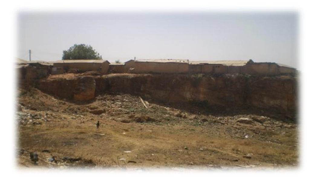
Fig. 4: Sewage/waste/refuse disposal in to mining ponds