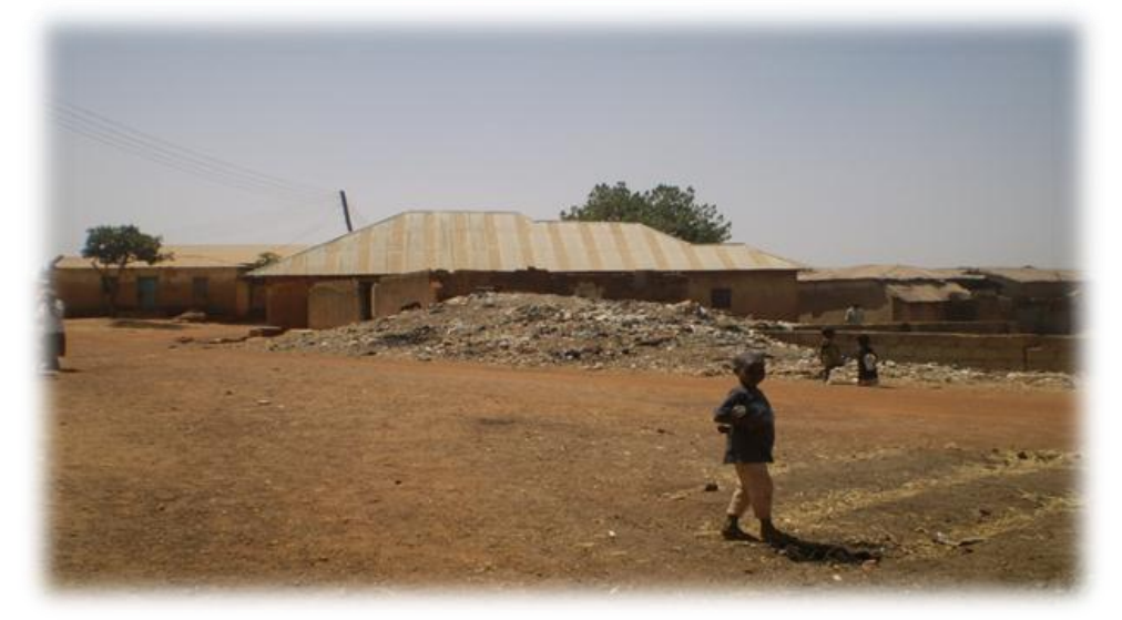
Fig. 3: Dumping of refuse close to houses/dwellings