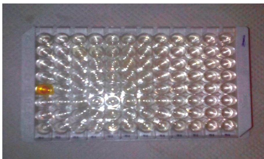
Picture 2: Plate showing the outcome of HBsAg ELISA run on samples earlier tested negative for HBsAg by immunochromatographic Skytec rapid strip. The first column shows the positive control reaction