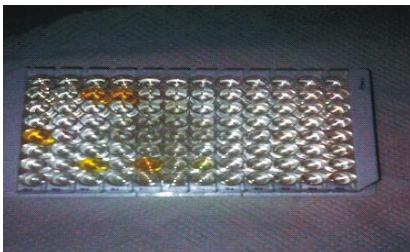
Picture 1: Plate after ELISA straight run for HBsAg First column show reactive positive control while positive samples are seen within close range to one another